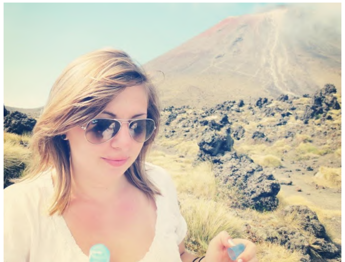
Victoire Rue, France