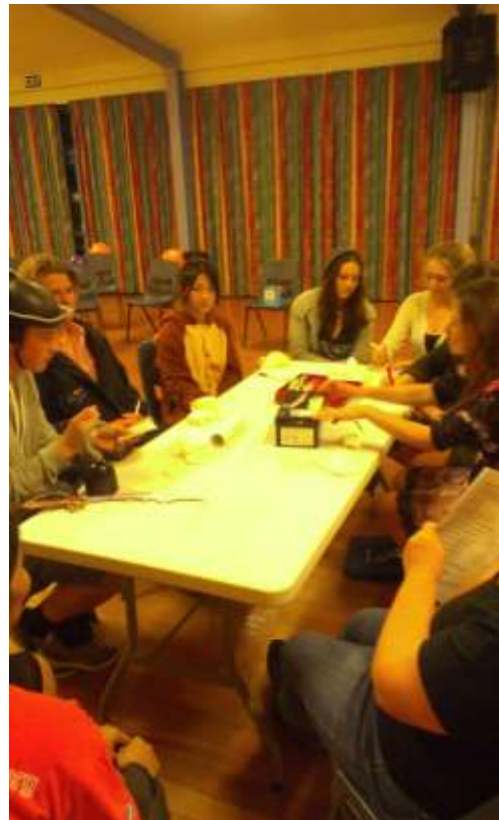
Fear Factor ... hosted and selected students